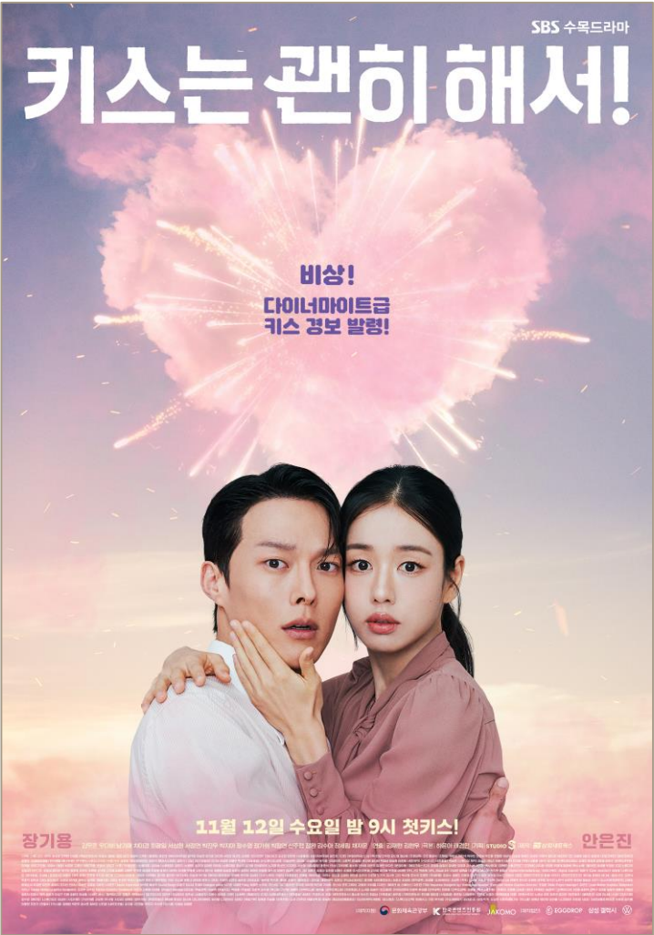
Sponsored the SBS drama