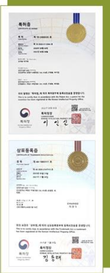
Patent & Trademark 제 10 - 2408335 호 제 40 - 1803109 호 외 5건