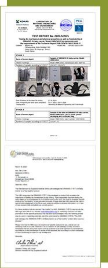
International Certifications European Baby Product Safety Test IHD (International Hip Dysplasia Institute)