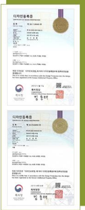
Design License 제 30 - 1120365 호 제 30 - 1122693 호